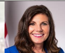
Congressman Diana Harshbarger

www.hagerty.senate.gov/ DC (202) 224-4944 Tri-Cities (423)-325-6240