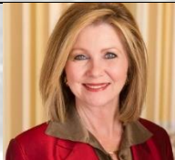
U.S. Senator Marsha Blackburn

www.blackburn.senate.gov DC (202) 224-3344 Tri-Cities (865) 540-3781