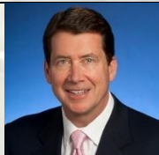
U.S. Senator Bill Hagerty

www.blackburn.senate.gov DC (202) 224-3344 Tri-Cities (865) 540-3781