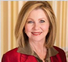
U.S. Senator Marsha Blackburn