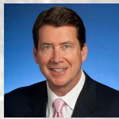
U.S. Senator Bill Hagerty