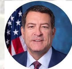
Congressman Mark Green