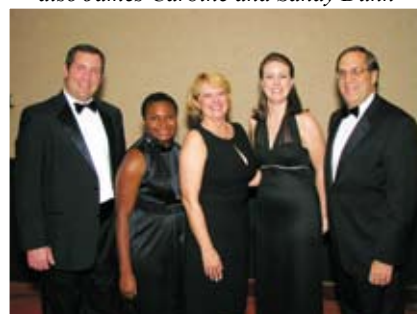
The HBAT staff