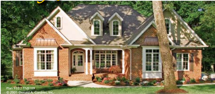
Plan 933 / TNB109 © 2001 Donald A. Gardner, Inc.