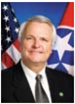
Ron Ramsey, Lt. Governor and Speaker of the Senate